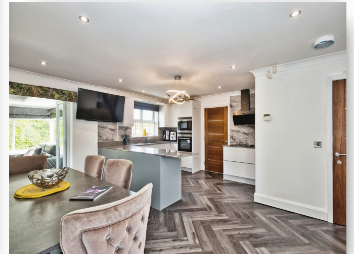
Hides Close, Ingoldmells Skegness PE25 1JT