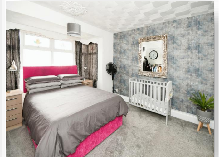
Sunningdale Drive, Skegness PE25 1BB