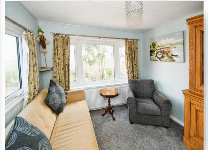
Sycamore Lodge Wainfleet Bank, Wainfleet Skegness PE24 4ND