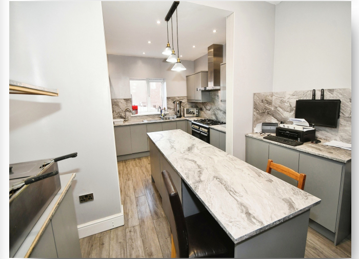
Drummond Road, Skegness PE25 3EH