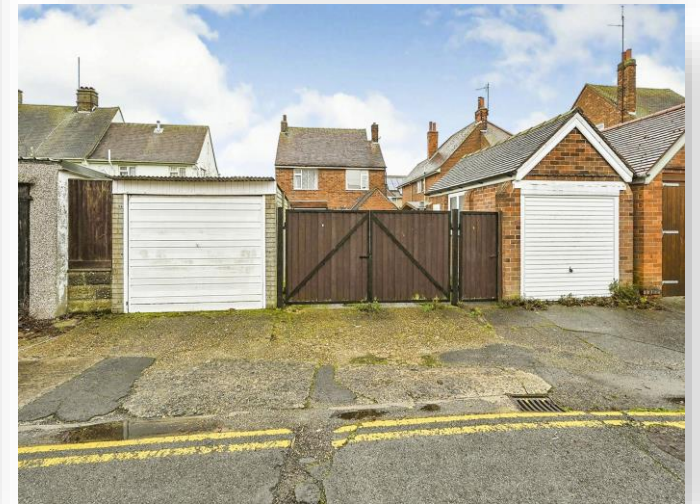
Glentworth Crescent, Skegness PE25 2TG