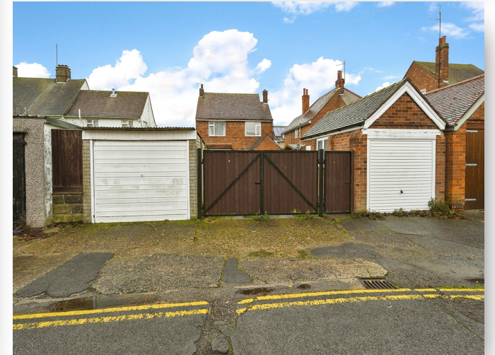
Glentworth Crescent, Skegness PE25 2TG