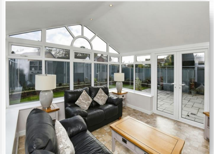
Turners Crescent, Wainfleet Skegness PE24 4BG