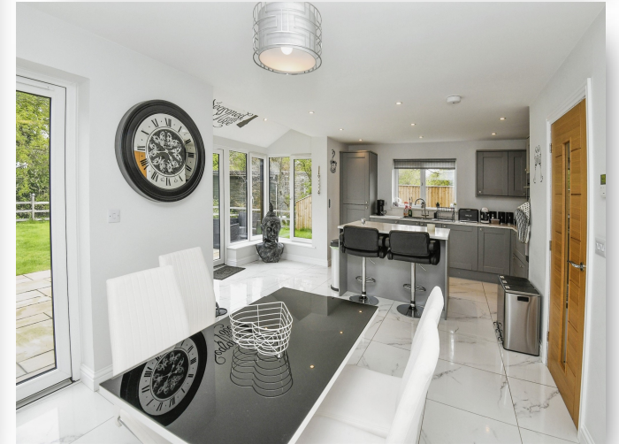
Amelia Wood Way, Grimoldby Louth LN11 8GJ