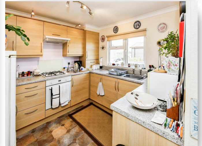
Pear Tree Manor Park Wainfleet Bank, Wainfleet Skegness PE24 4ND