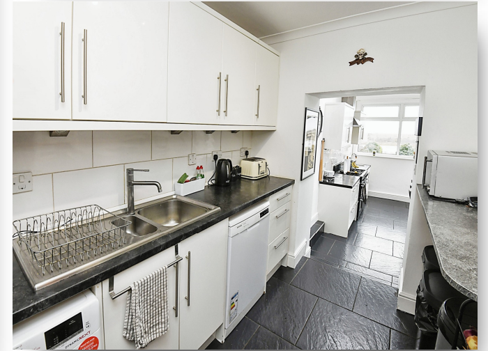
Seacroft Esplanade, Skegness PE25 3BE