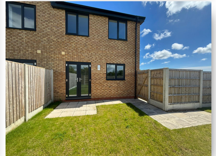
Plot 25 Draycott Way, Chapel St. Leonards Skegness PE24 5WG