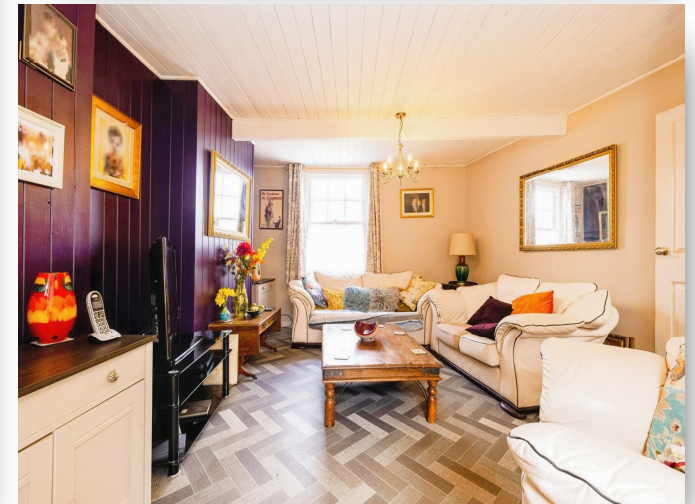
Market Place, Wainfleet Skegness PE24 4BT