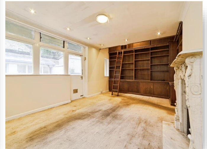
Park Drive, Bradford BD9 4DR