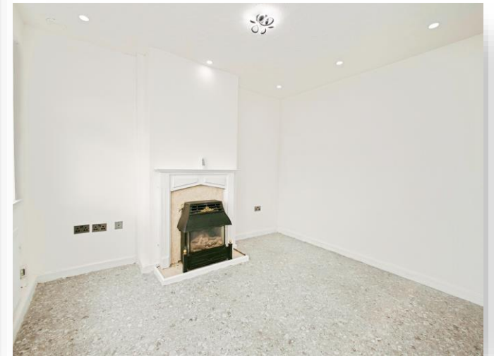
Freshfield Gardens, Allerton Bradford BD15 7PR