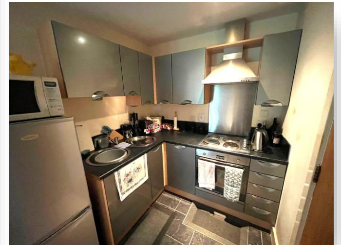
Venue Harrogate Road, Bradford BD2 3HA