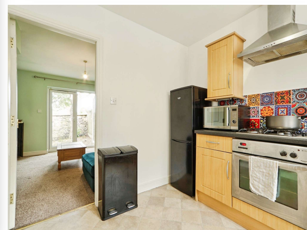
Platt Court, SHIPLEY BD18 1GA