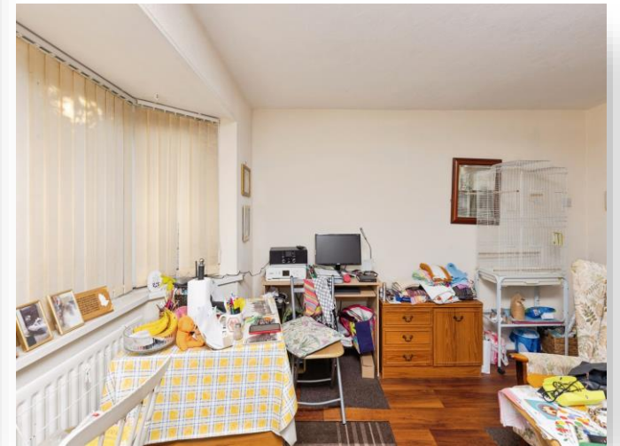
Flat Leeds Road, Shipley BD18 1DF