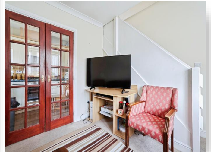
Holland Park, BRADFORD BD9 6AF