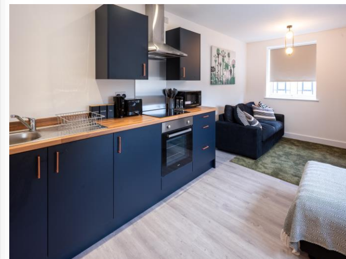
The Printworks Bingley Road, Bradford BD9 6FJ