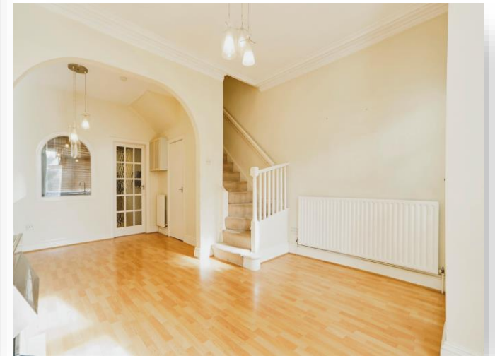
Alexandra Road, Shipley BD18 3ER