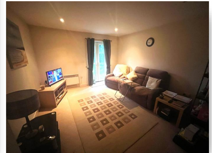
Venue Harrogate Road, Bradford BD2 3HA