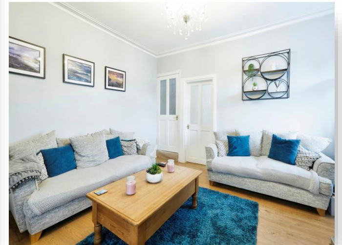
Wilsden Road, Allerton Bradford BD15 9AD