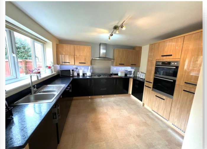
Plantation Drive, Bradford BD9 6SG