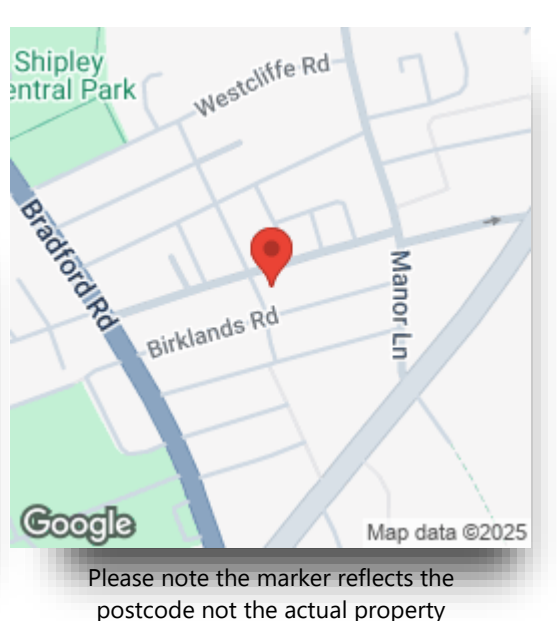
view this property online williamhbrown.co.uk/Property/SHP109606