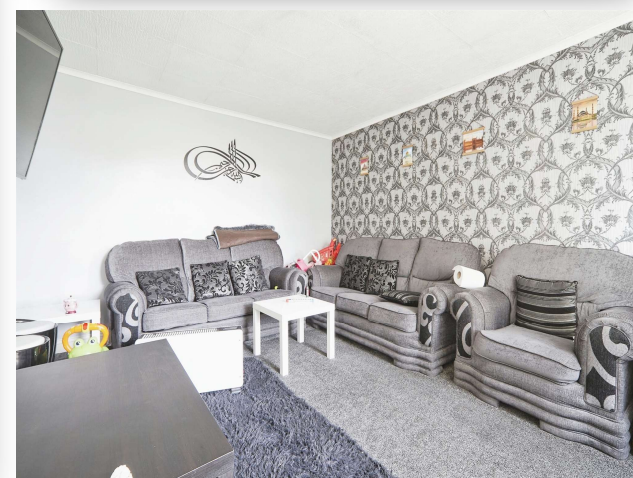
Flawith Drive, Bradford BD2 3PE