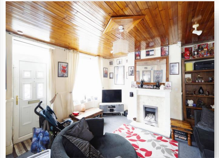
Rosebery Avenue, Shipley BD18 2JZ