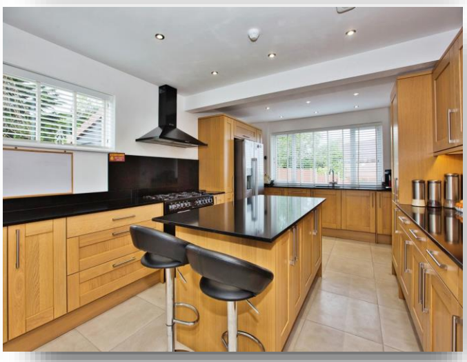
Lapinsfield, Chilthorne Hill, Chilthorne Domer, Yeovil, BA22 8QY