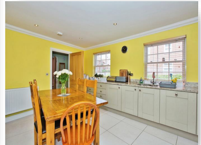
Newcross Crescent, Yeovil, BA21 3FN