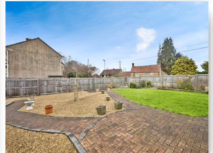
Canterbury Bells, Ansford Hill, Castle Cary, BA7 7JL