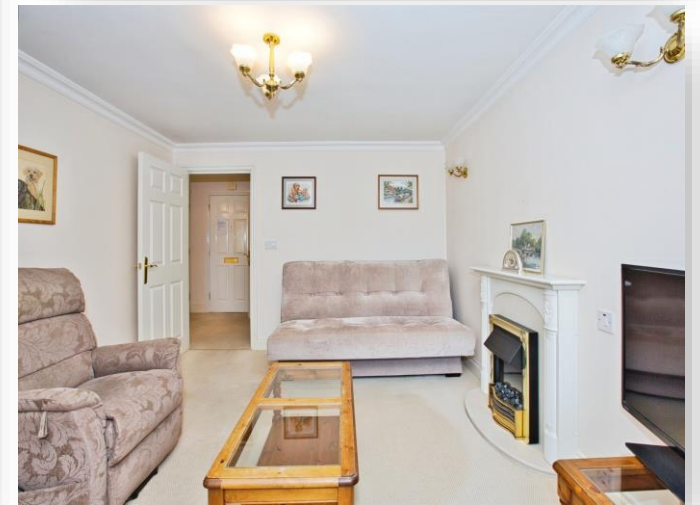
Pegasus Court, South Street, Yeovil, BA20 1ND