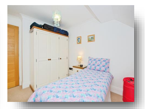
Over Stratton Rd