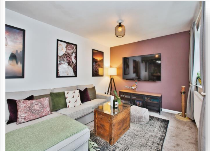
Clovermead, Yetminster, Sherborne, DT9 6LR