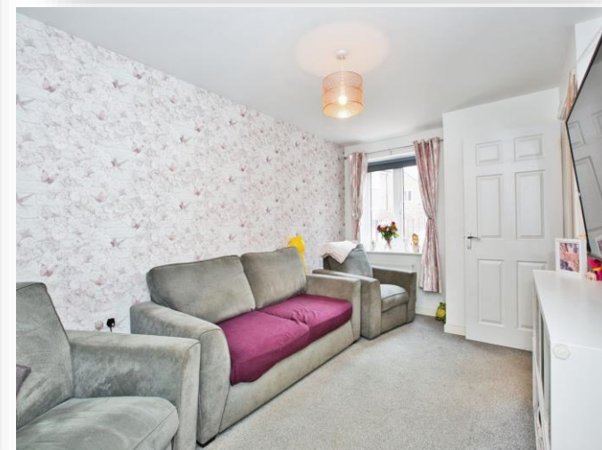
Heron Drive, Houndstone, Yeovil, BA22 8FZ