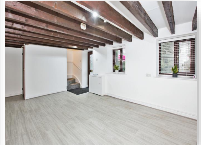
Alexander Cottages, Queen Street, Keinton Mandeville, Somerton, TA11 6EQ