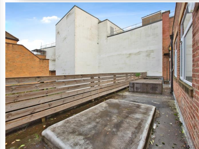
Flat 1 Middle Street, Yeovil, BA20 1LF