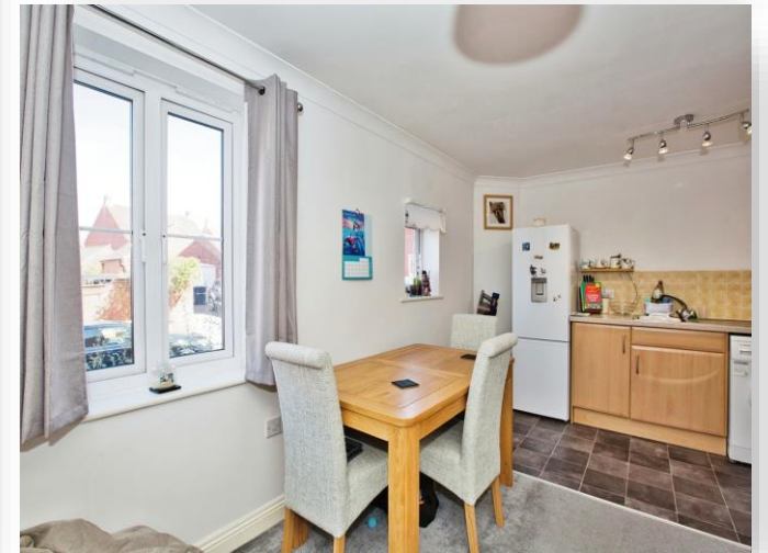
Monk Barton Close, Yeovil, BA21 3UU