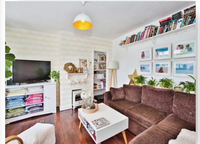
Broadway, Higher Odcombe, Yeovil, BA22 8XF