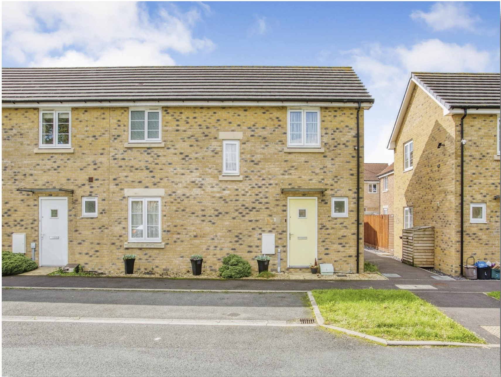
Kite Place, Brympton, Yeovil, BA22 8BS