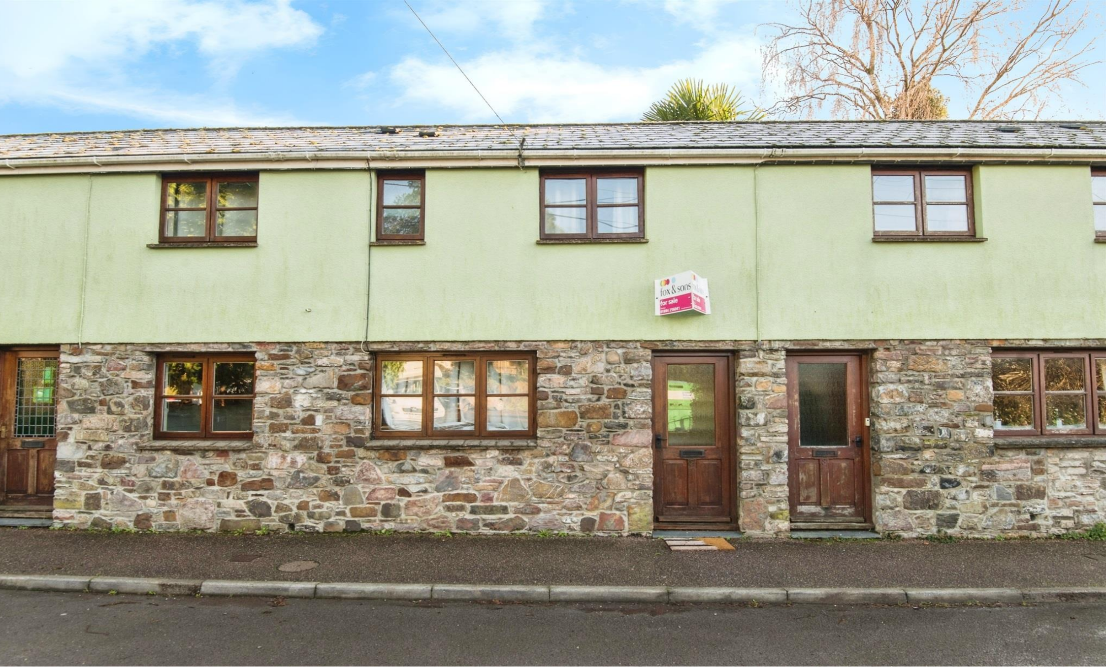
The Sidings, Bampton Tiverton EX16 9QJ