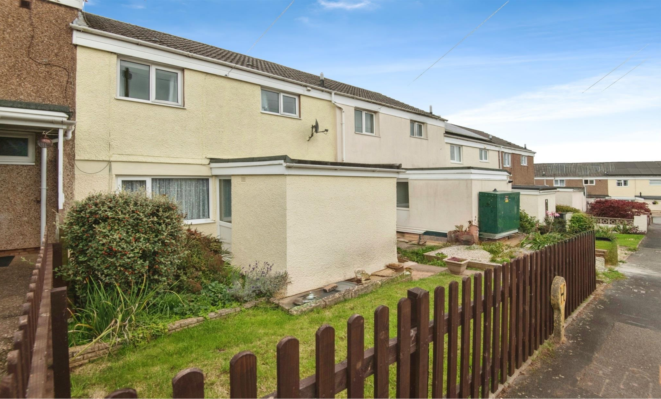
Marshall Close, Tiverton EX16 4AT