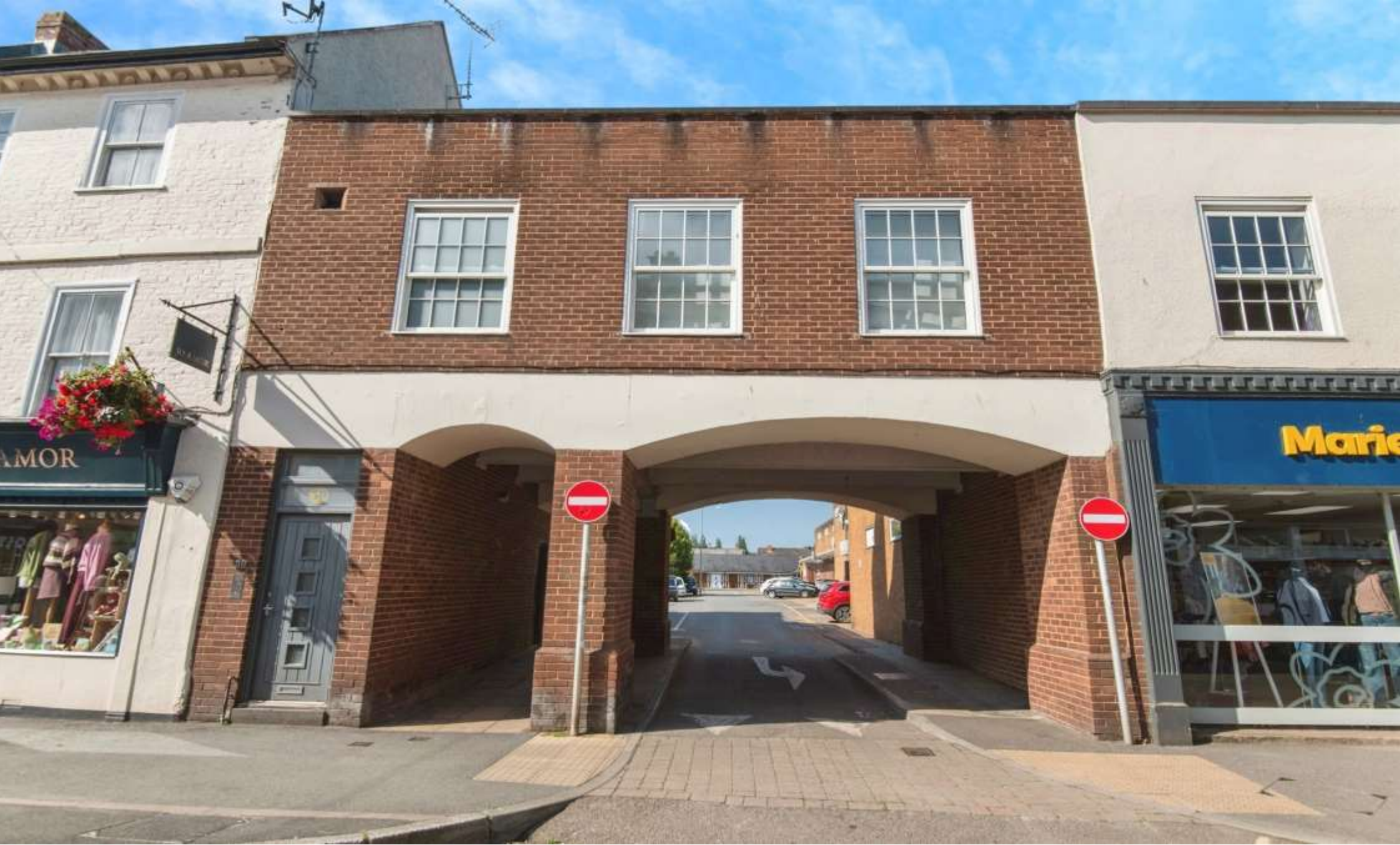
Bampton Street, Tiverton EX16 6AH