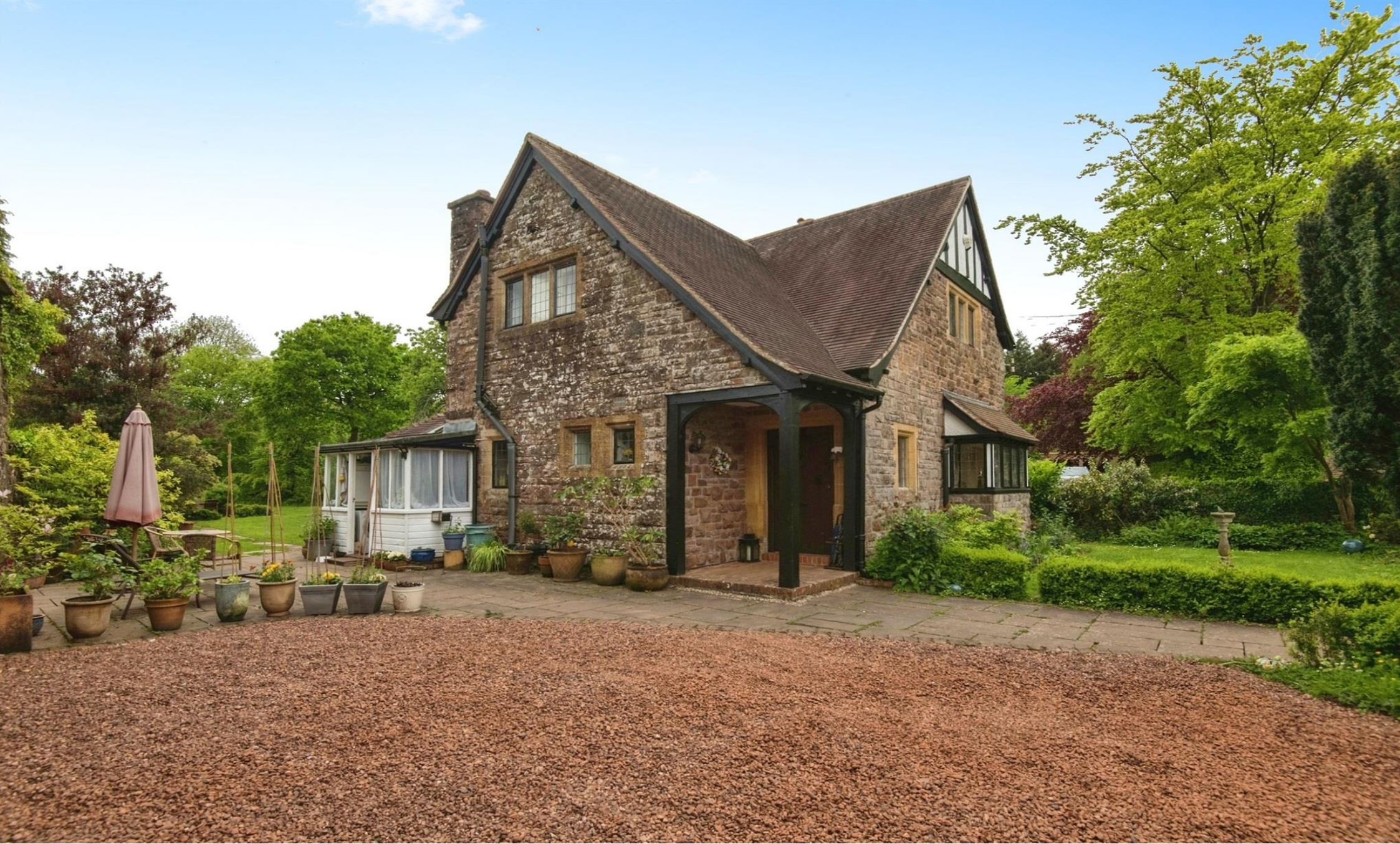
. Court Gardens Cottage, Stoodleigh Tiverton EX16 9PL