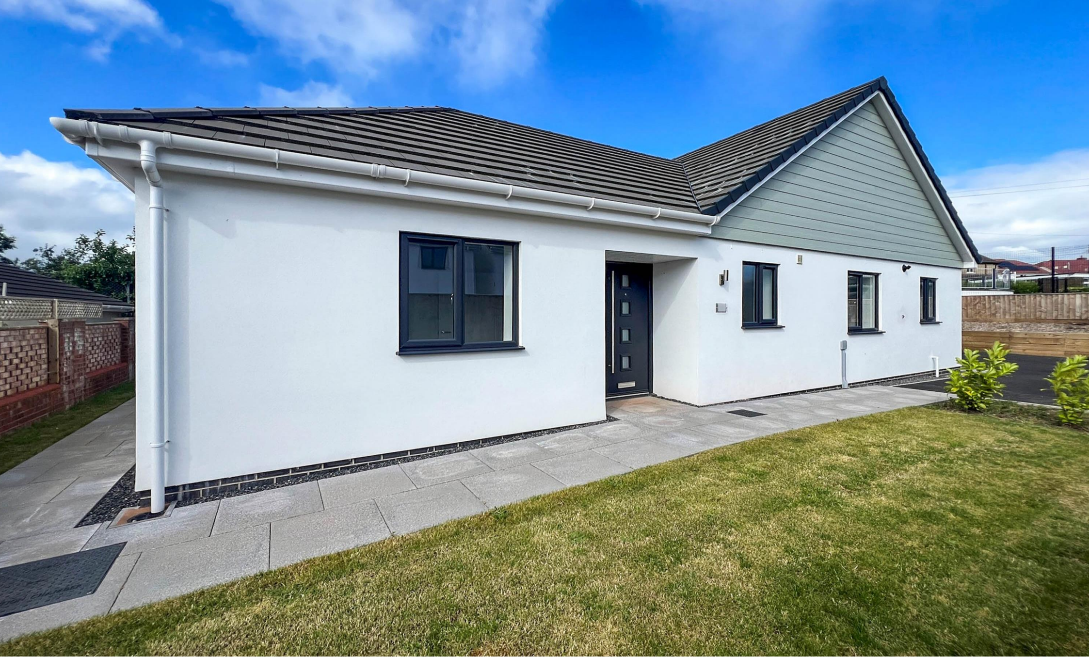
Cherry Garden Cottage Cherry Tree Gardens, Tiverton EX16 6ST