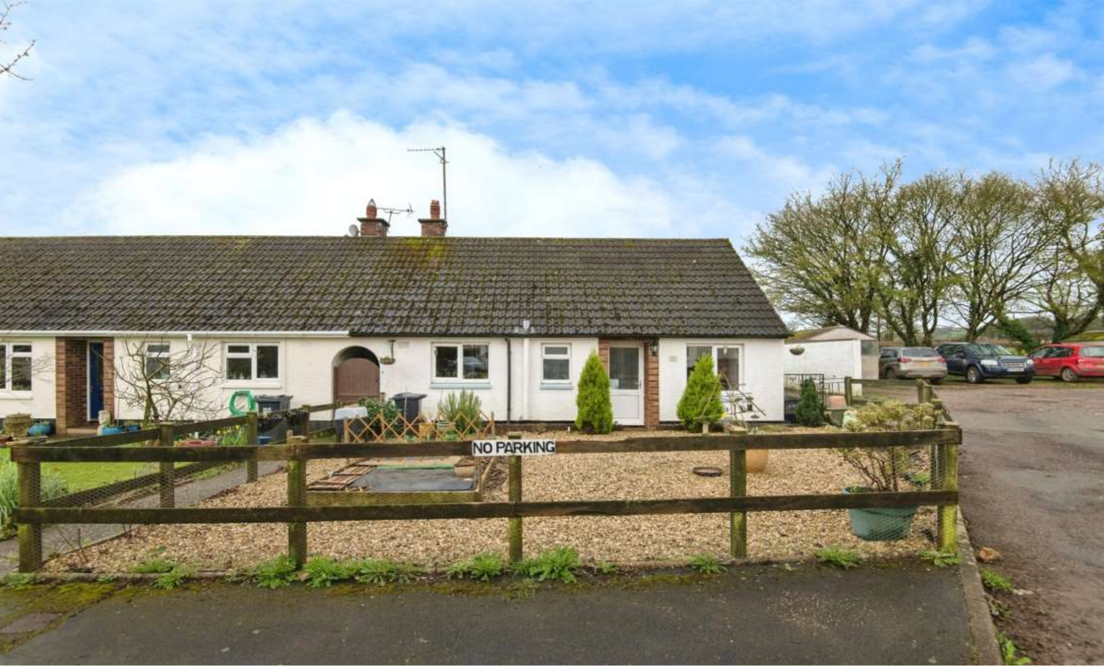
South View, Westleigh Tiverton EX16 7HR