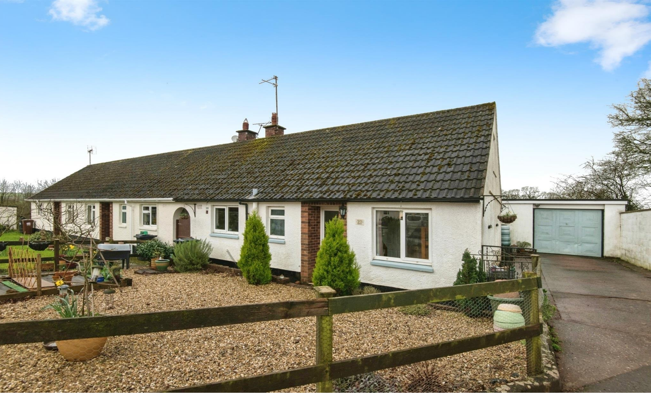
South View, Westleigh Tiverton EX16 7HR