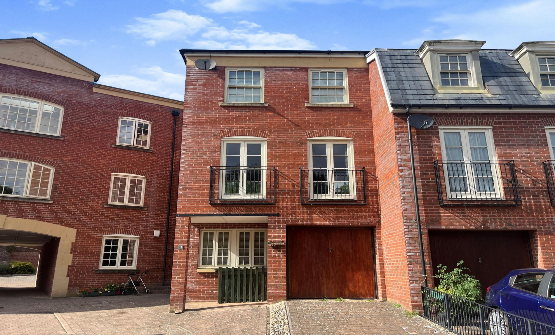
Old Mill Close, Tiverton EX16 6FL