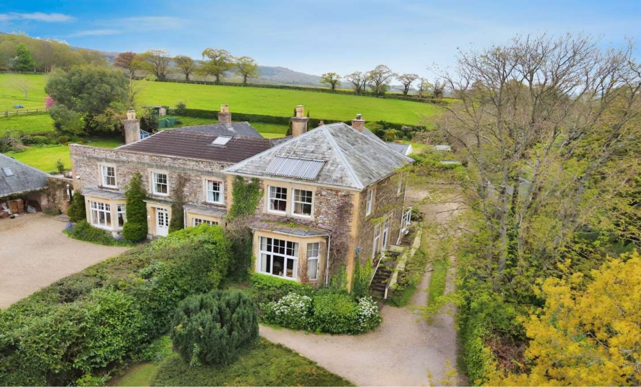
Brookfield Lodge, Blagdon Hill Taunton TA3 7SL