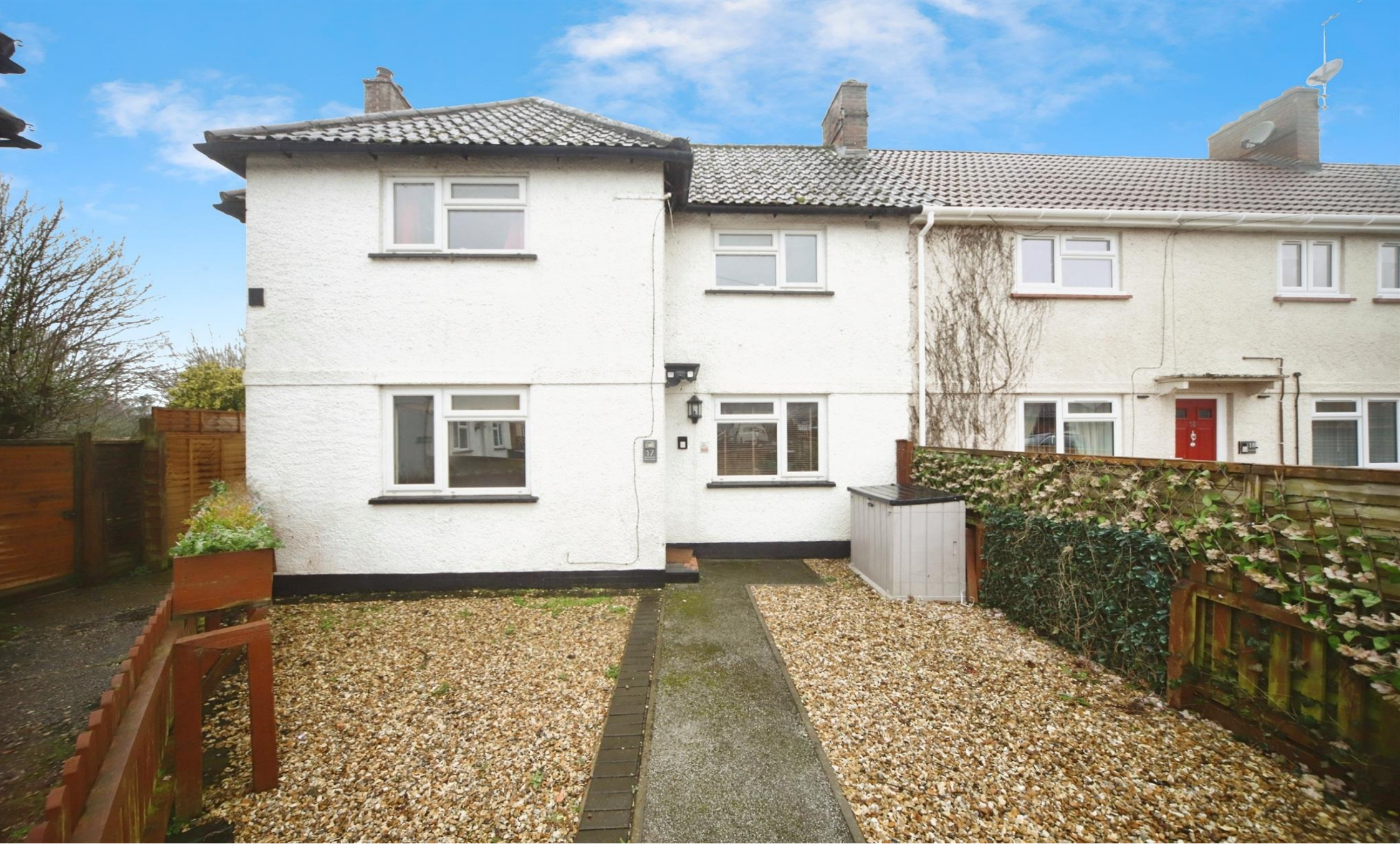
Elms Estate, Monkton Heathfield Taunton TA2 8NZ