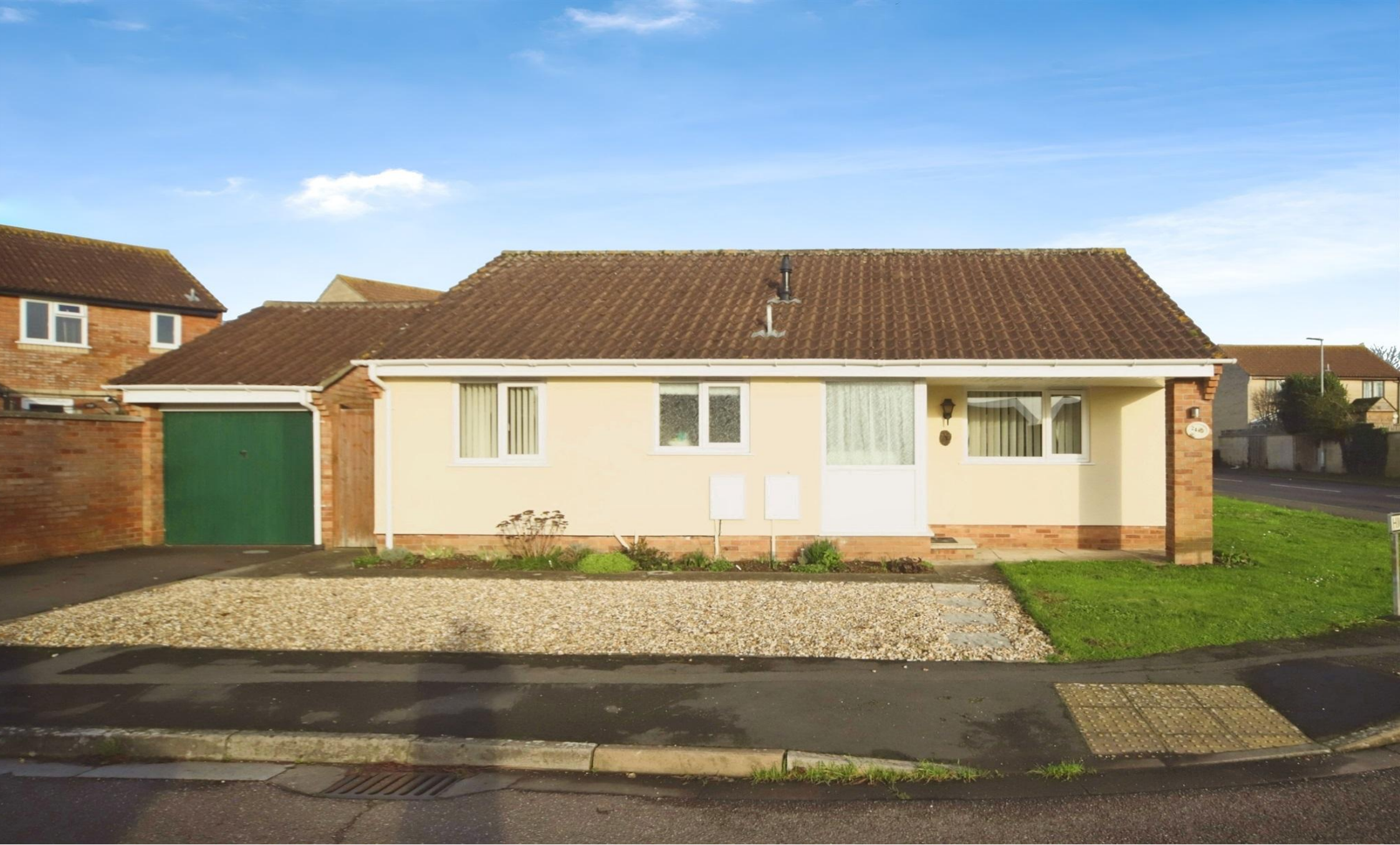
Highgrove Close, BRIDGWATER TA6 6UF