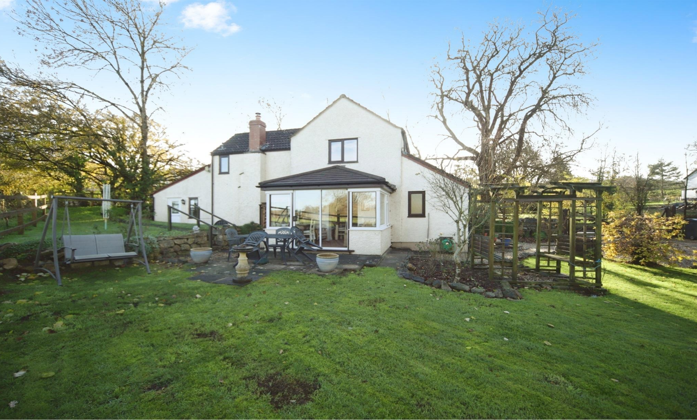
Wayside Curland, Curland Taunton TA3 5BD